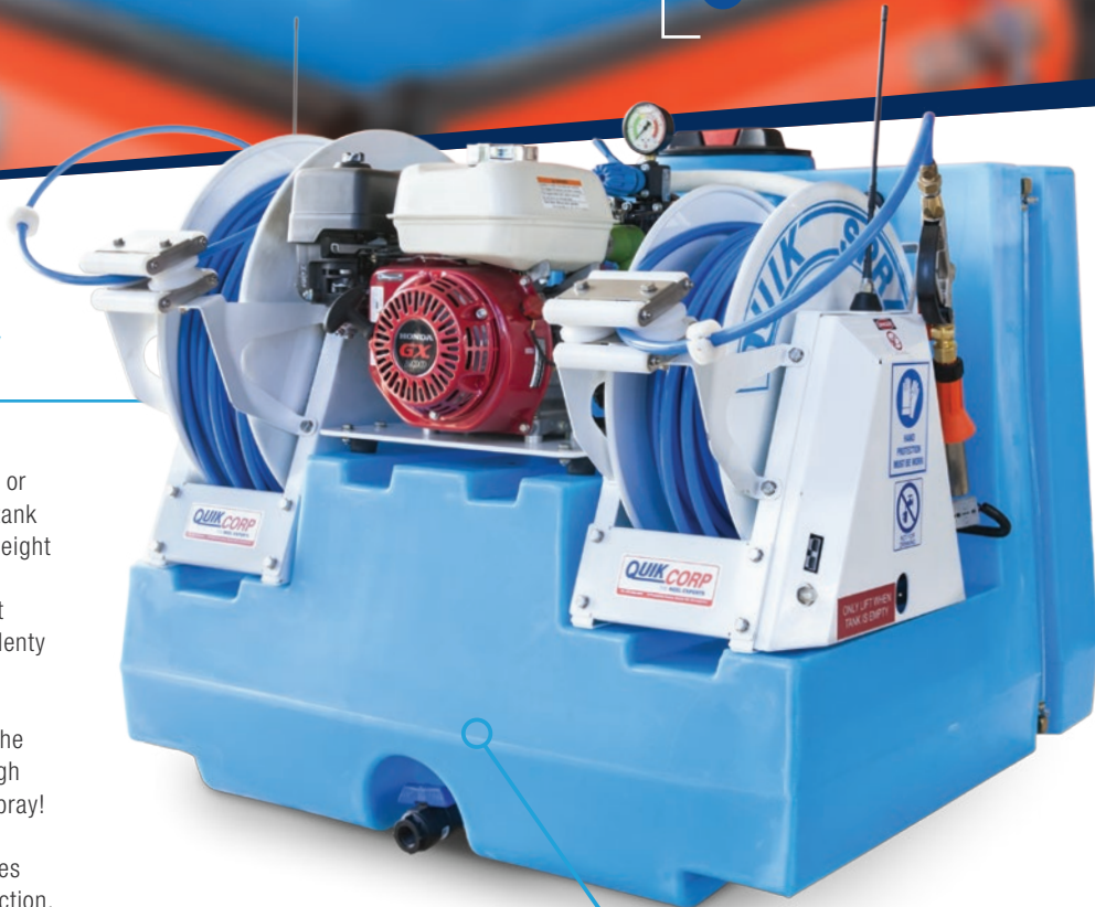
QR400 TWIN REEL SPRAY UNIT

Easy to load and remove when you are finished your spraying tasks. The QR400 is the most compact footprint in the whole Quik Spray range!